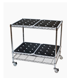
Large Recharging Station 48 Lamps