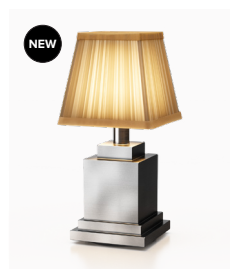
Satin Nickel Plated Solid Brass with Pleated Silk Shade