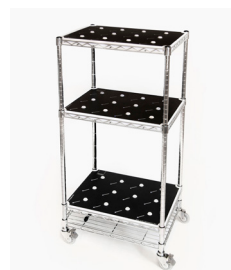
Medium Recharging Station 36 Lamps