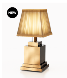
Polished Solid Brass with Pleated Silk Shade