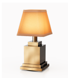
Polished Solid Brass with Parchment Shade