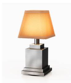
Satin Nickel Plated Solid Brass with Parchment Shade