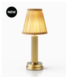
Natural Solid Brass with Pleated Silk Shade