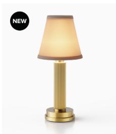
Natural Solid Brass with Cotton Shade