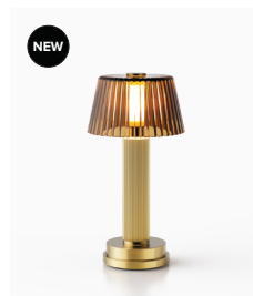
Natural Solid Brass with Amber Glass Shade