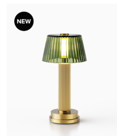
Natural Solid Brass with Green Glass Shade