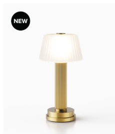
Natural Solid Brass with Frosted Glass Shade