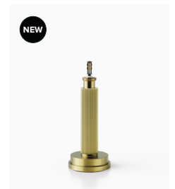
Natural Solid Brass with No Shade

NEOZ The darling of dining tables www.neoz.com