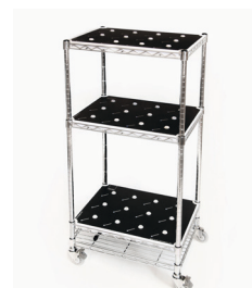
Medium Recharging Station 36 Lamps