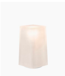
Sand Blasted Pressed Glass