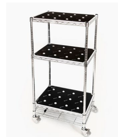
Medium Recharging Station 36 Lamps