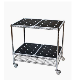
Large Recharging Station 48 Lamps