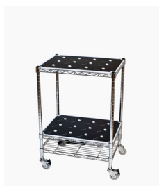
Small Recharging Station 24 Lamps