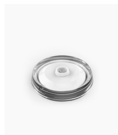
Single Lamp Charger 1 Lamp