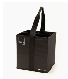
Handling Accessory 4 Lamp Carrier (Optional)