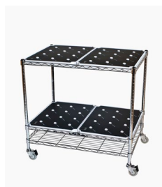
Large Recharging Station 48 Lamps