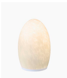
Hand Blown Glass Opal