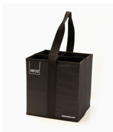
Handling Accessory 4 Lamp Carrier (Optional)

NEOZ Bringing together - Food, People, Places. www.neoz.com