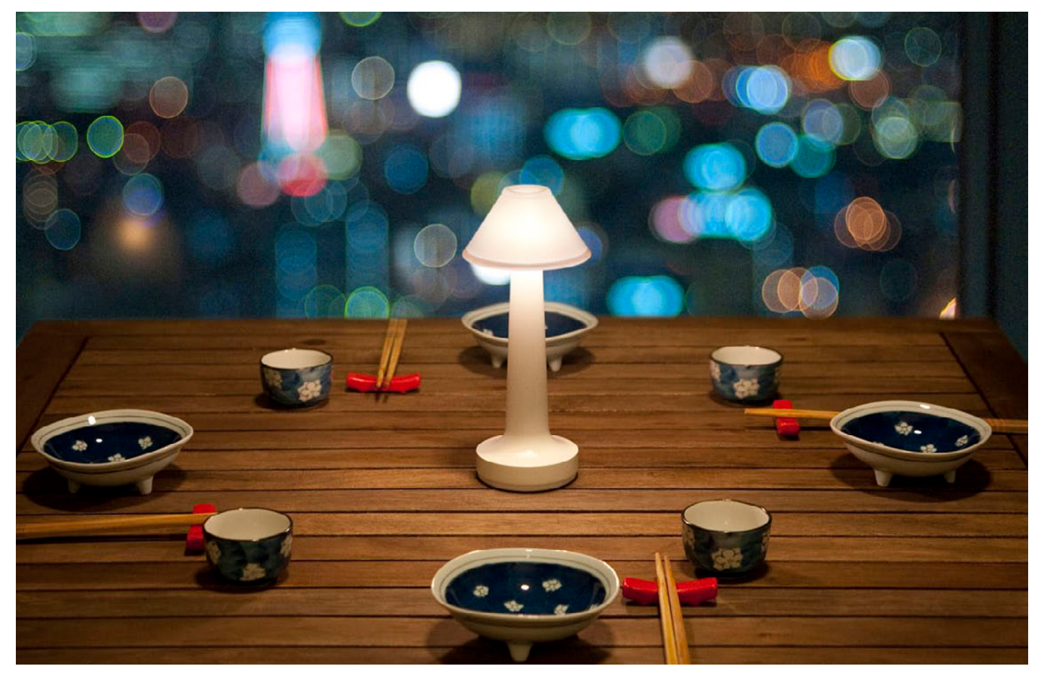
COOEE 3 - IVORY Installation