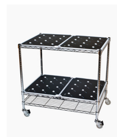
Large Recharging Trolley 48 Lamps