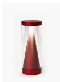
Anodised Fire Red Aluminium