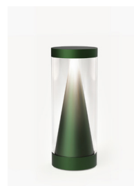
Anodised Forest Green Aluminium