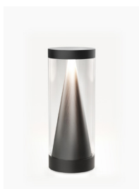
Anodised Shadow Grey Aluminium