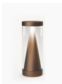
Anodised Mocha Aluminium