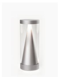
Anodised Silver Aluminium