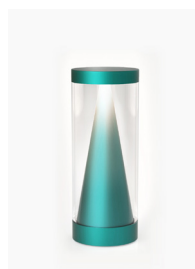
Anodised Barrier Reef Aluminium