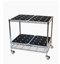
Large Recharging Trolley 48 Lamps