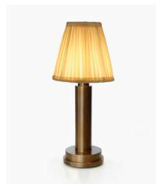
Natural Aged Brass with Pleated Silk Shade