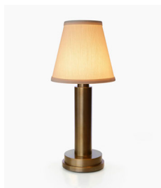
Natural Aged Brass with Cotton Shade