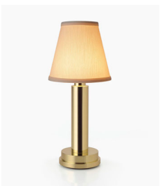
Lacquered Solid Brass with Cotton Shade