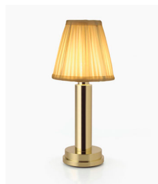
Lacquered Solid Brass with Pleated Silk Shade