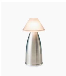
Anodised Stainless Steel