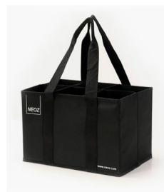
Handling Accessory 6 Lamp Carrier (Optional)