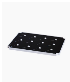
Large Recharging Tray 12 Lamps