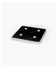
Small Recharging Tray 4 Lamps