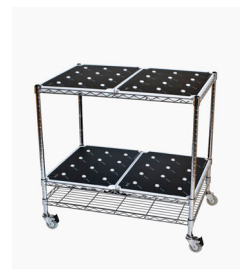
Large Recharging Trolley 48 Lamps