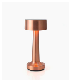
Lacquered Real Copper