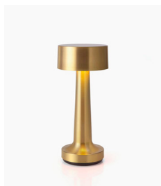
Lacquered Real Brass