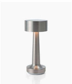
Anodised Silver Aluminium