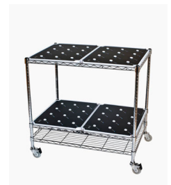
Large Recharging Trolley 48 Lamps