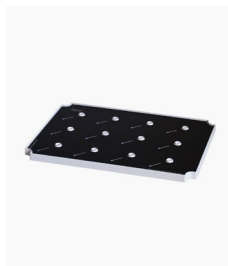
Large Recharging Tray 12 Lamps