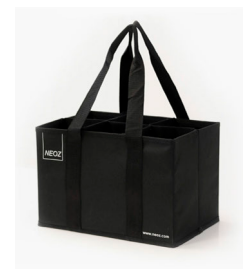
Handling Accessory 6 Lamp Carrier (Optional)