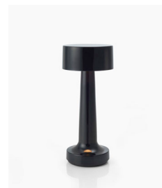
Anodised Satin Black Aluminium