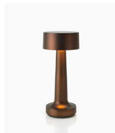
Anodised Satin Bronze Aluminium