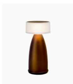
Applied Paint on Stainless Steel Antique Bronze