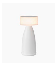
Baked Enamel Ivory