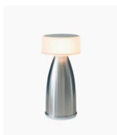
Anodised Stainless Steel