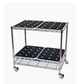
Large Recharging Trolley 48 Lamps