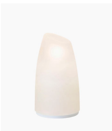
Sand Blasted Hand Blown Glass