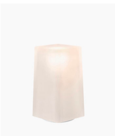
Sand Blasted Pressed Glass