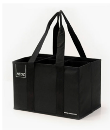
Handling Accessory 6 Lamp Carrier (Optional)