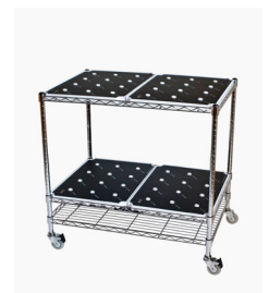
Large Recharging Trolley 48 Lamps