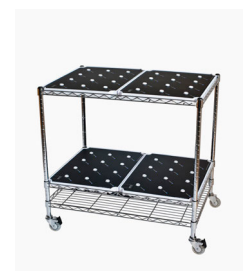
Large Recharging Trolley 48 Lamps