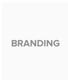
Commerical Customisation Logos