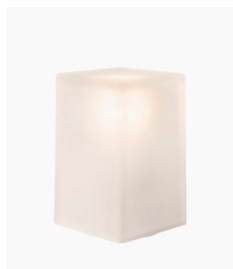
Sand Blasted Pressed Glass