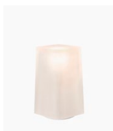
Sand Blasted Pressed Glass