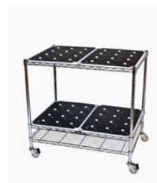
Large Recharging Trolley 48 Lamps