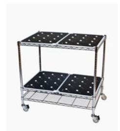
Large Recharging Trolley 48 Lamps