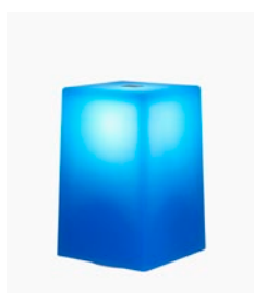
Plexiglas® & textured Sapphire