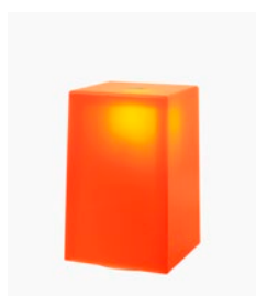
Plexiglas® & textured Amber