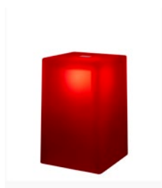
Plexiglas® & textured Ruby