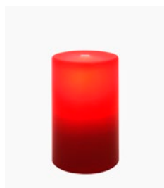
Plexiglas® & textured Ruby