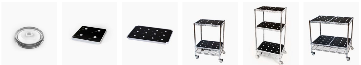
Single Base Station 1 Lamp Small Recharging Tray 4 Lamps Large Recharging Tray 12 Lamps Small Recharging Trolley 24 Lamps Medium Recharging Trolley 36 Lamps Large Recharging Trolley 48 Lamps

POWER SOURCE 100 - 240V Switch-Mode Electronic Power Supply Approved for worldwide usage supplied with appropriate mains electric plug type