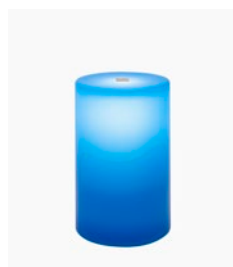
Plexiglas® & textured Aqua