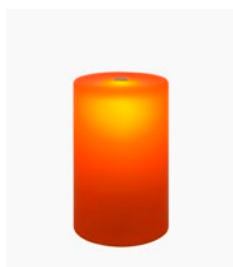
Plexiglas® & textured Amber