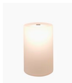
Plexiglas® & textured Opal