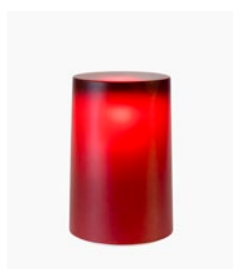
Handmade Resin Ruby