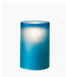
Handmade Resin Sapphire