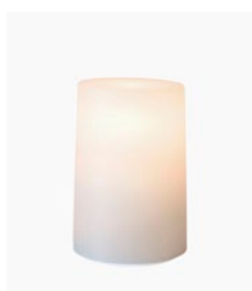
Handmade Resin Opal