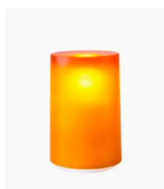
Handmade Resin Amber