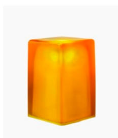
Handmade Resin Amber