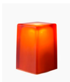
Handmade Resin Ruby