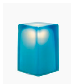
Handmade Resin Sapphire