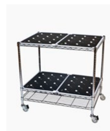
Large Recharging Trolley 48 Lamps