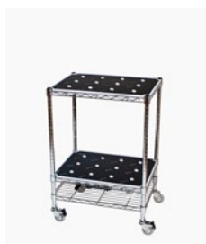
Small Recharging Trolley 24 Lamps