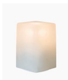
Handmade Resin Opal