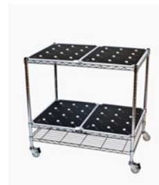
Large Recharging Trolley 48 Lamps