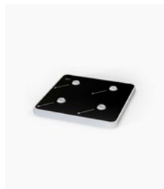
Small Recharging Tray 4 Lamps