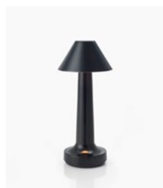
Anodised Satin Black