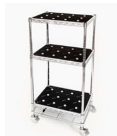
Medium Recharging Trolley 36 Lamps