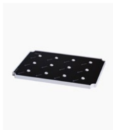
Large Recharging Tray 12 Lamps