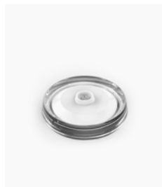
Single Base Station 1 Lamp