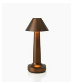
Anodised Satin Bronze