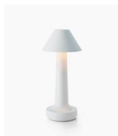
Baked Enamel Gloss Ivory White