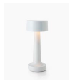
Baked Enamel Gloss Ivory White