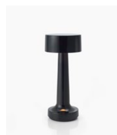
Anodised Satin Black