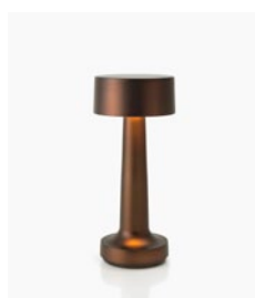
Anodised Satin Bronze