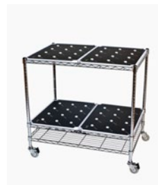
Large Recharging Trolley 48 Lamps