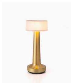
Lacquered Real Brass