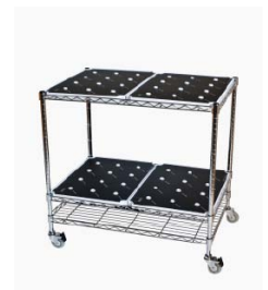
Large Recharging Trolley 48 Lamps