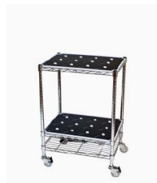
Small Recharging Trolley 24 Lamps