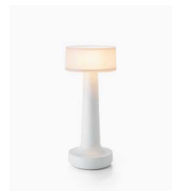
Baked Enamel Gloss Ivory White Aluminium