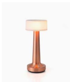
Lacquered Real Copper