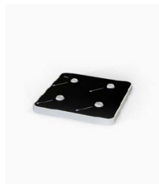
Small Recharging Tray 4 Lamps