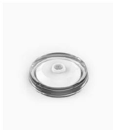
Single Base Station 1 Lamp