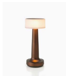
Anodised Satin Bronze Aluminium