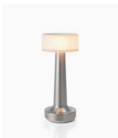
Anodised Silver Aluminium