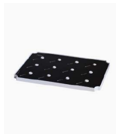
Large Recharging Tray 12 Lamps