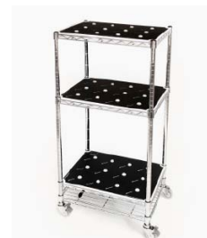
Medium Recharging Trolley 36 Lamps