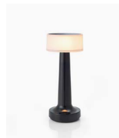
Anodised Satin Black Aluminium