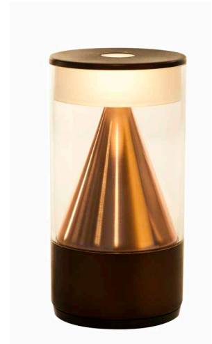
Antique Bronze & Copper