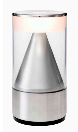
Stainless Steel & Aluminium

Weight PRO - 0.85 kg / 1.9 lb ECO - 0.74 kg / 1.6 lb UNO - 0.62kg / 1.3lb