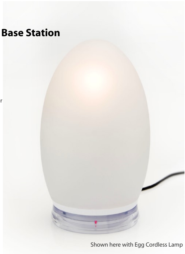
Shown here with Egg Cordless Lamp